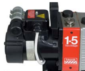
Pre-1994 manufactured pump metal-cased capacitor