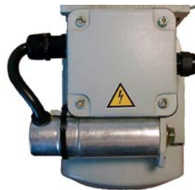
200-240 Volt standard pump replacement metal-cased capacitor