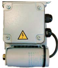
100-120 Volt standard pump original plastic-cased capacitor