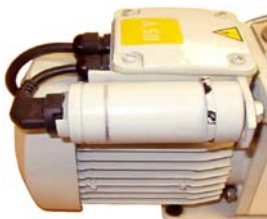
Hewlett Packard GC-MS pump original capacitor with plastic connector