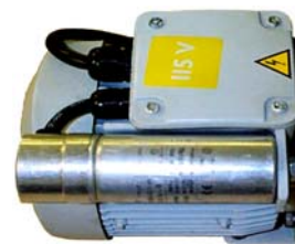
Hewlett Packard GC-MS pump replacement capacitor with metal connector