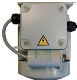
200-240 Volt standard pump original plastic-cased capacitor