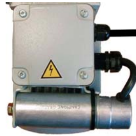
100-120 Volt standard pump replacement metal-cased capacitor